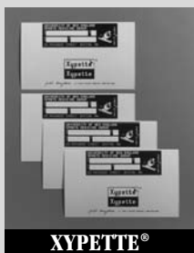
XYPETTE® Standard all-white adhesive X-ray ID cards