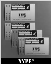
XYPE® Adhesive X-ray ID cards color-coded for year